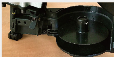
Nail support quick adjustment