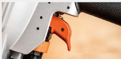
Single sequential actuation trigger available