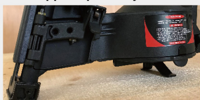
Adjustable magazine plate